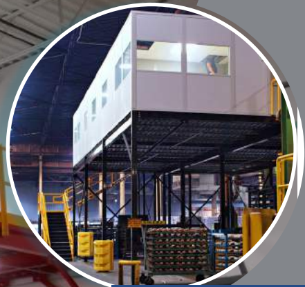
Add an Office