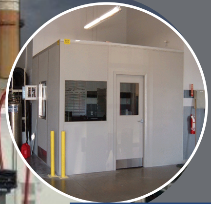
2 Day Offices